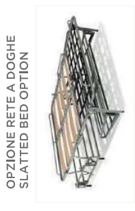
OPZIONE RETE A DOGHE SLATTED BED OPTION