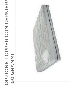
OPZIONE TOPPER CON CERNIERA 150 GRAMMI