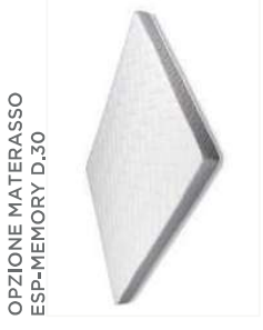
OPZIONE MATERASSO ESP-MEMORY D.30